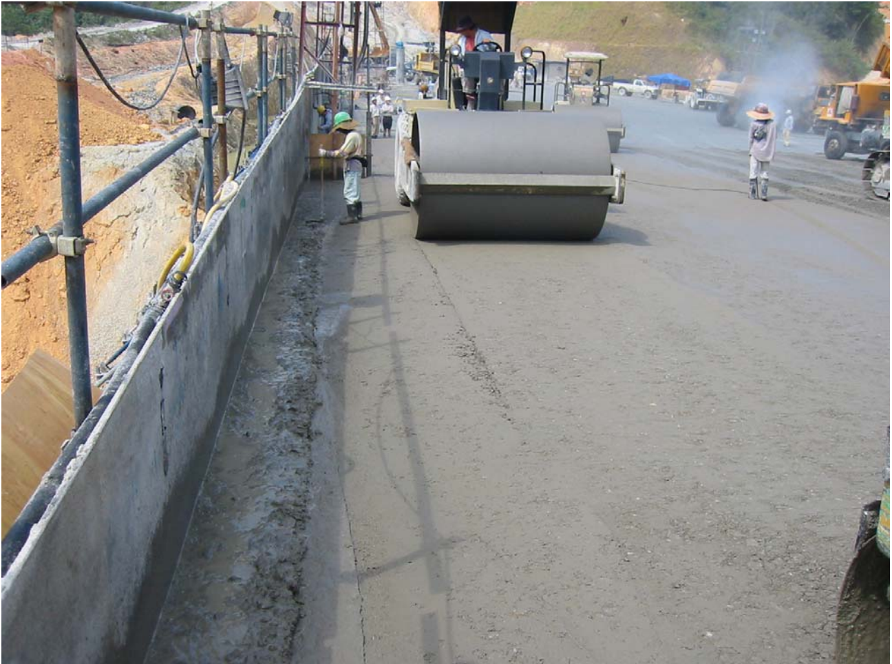
Photo 11 - RCC compaction of the sloping layer alongside the GERCC facing, followed by hand tamping the raised edge of GERCC

The GE-RCC will be displaced upwards by the roller, this is not of concern as long as it is no more than 10-20mm, otherwise grout dose rates should be reduced.