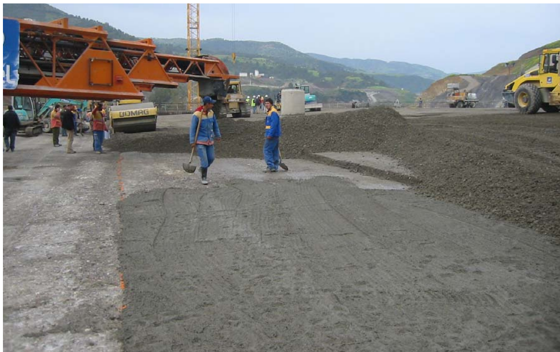
Photo 6 - Koudiat Acerdoune Dam, crawler placer for SLM in 1.2m high lifts

Since the 300mm thick layers of RCC are placed within the initial set time of the previously placed layer, a greater RCC loading on the formwork will be experienced before the lower layers reach final set condition. The design of the upstream and downstream formwork and its anchorage back into the RCC, needs to take account of this increased loading when using the sloped layer method.