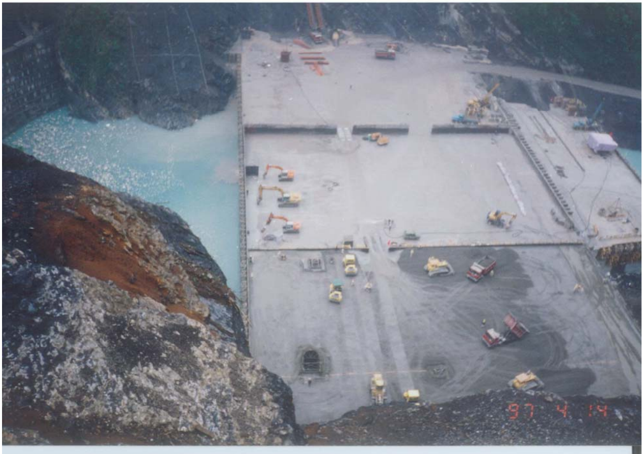
Photo1 - Jiangya Dam, 131m high, 1.1 mill m3 China 1997, placing 10 layers of RCC in a formed 3.0m block

In this way 10 layers of RCC would be placed all within the retarded initial set time of the RCC. A gap in the form and a sloped RCC ramp allowed access into the placement area. On completion of the lift the transverse form would be re-erected and the adjoining 3m lift placed. The surface of the cold lift joint would be 'greencut' and a bedding mortar applied with the first RCC layer. The process was encumbered with the cost and time of setting up the transverse form and the cost of the retarding admixture, but offset by the time and cost saved in lift joint preparation.