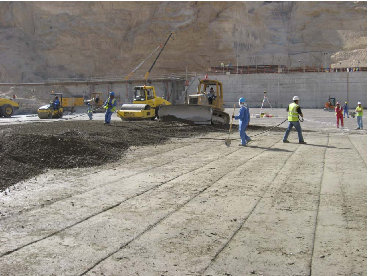
Photo 3 - Wadi Dayqah Dam 80m high, 0.6 mill m 3 Oman 2008 placing 4 RCC layers in a 1.2m lift rolled down without end form

On some projects that are set up for very high RCC placement rates, often using a high pozzolan or fly ash content in the RCC mix which, together with a retarding admixture, can achieve delayed initial set times of 18-24 hours, it is possible to place a single 300mm lift over the full area of the dam within the delayed initial set time of the previously placed lift.