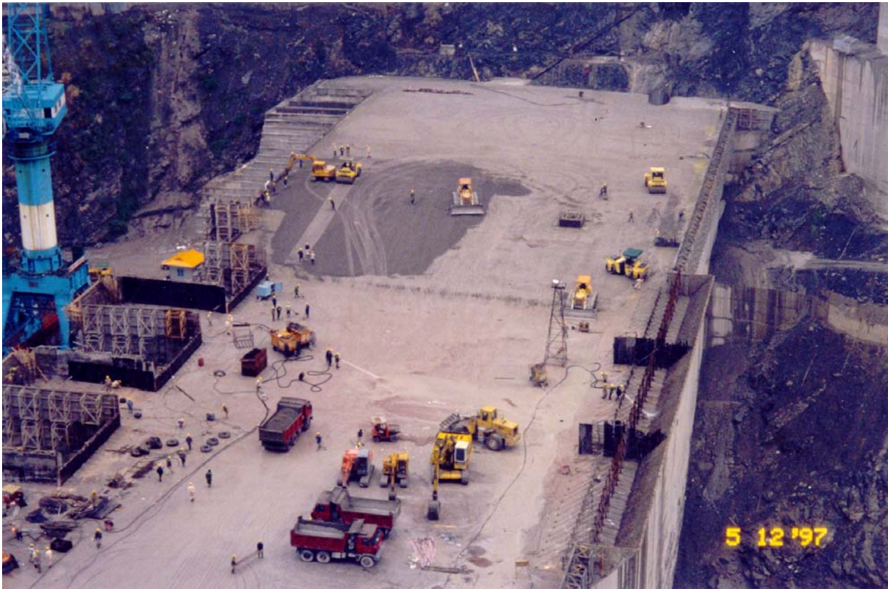
Photo 5 - Jiangya Dam showing the SLM using 3m high lifts

Hence, for this example, at lower elevations, where the width W is say 100m, then a slope of 1 on 10 is required. Later, when the width has reduced to say 25m at upper elevations nearer the crest, then a flatter slope of 1 on 40 might be adopted if the time between placing RCC layers of only 0.5 hours with a 1 on 10 slope is, for some reason, considered to be too short.