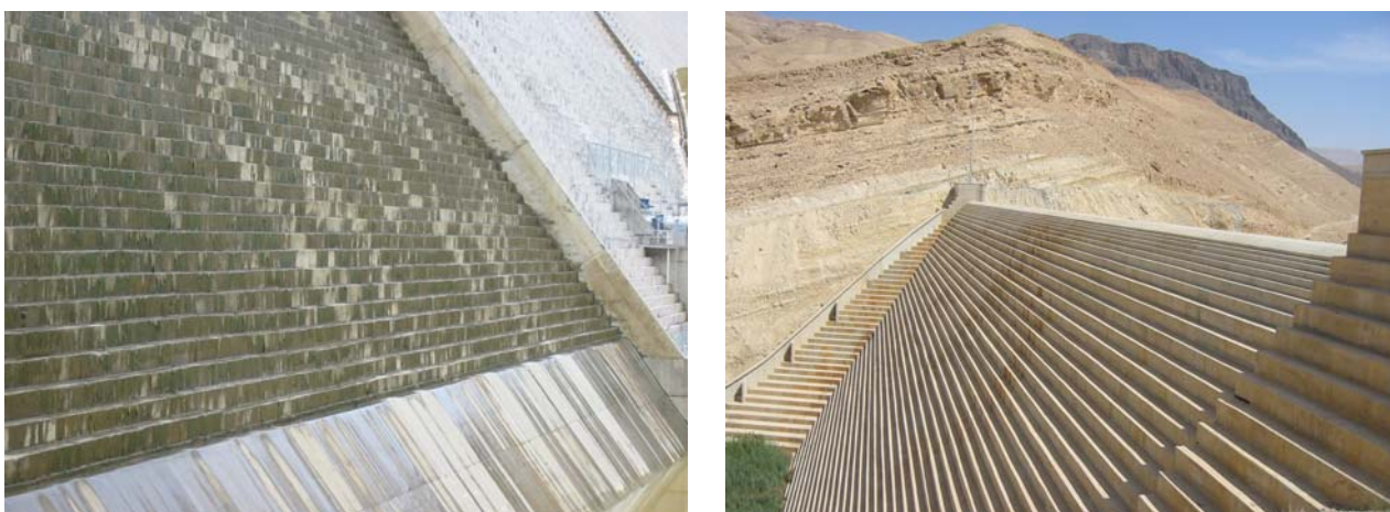
Photo 12 - GERCC spillway steps, left Kinta Dam 0.6m high after 6months of spillage, right Tannur Dam 1.2m high 7 years no spillage yet

Velocities down the spillway chute are high and finished surface quality and alignment were important issues to the designer. At Cadiangullong dam the lower 0.3m lift of the 0.6m high spillway steps were done in GE-RCC and the top lift in conventional concrete, as it was perceived by the contractor to be more easily finished to the required tolerances. Later at Tannur (60m high 0.25mill m 3 , Jordan 2000) and Kinta dams the full 1.2m and 0.6m high high spillway steps (respectively) were constructed using GERCC, initially using the usual horizontal RCC placing method with a later change made to the sloped layer method. At Ralco dam the 0.6m high downstream face steps were constructed in GERCC to provide a superior and more durable quality than plain RCC so as to better resist the colder temperatures and potential freeze-thaw problems. During construction the dam was overtopped on two occasions for nearly a week, flows of up to 500m 3 /s, 1m deep were experienced with absolutely no damage to the young GERCC facing.