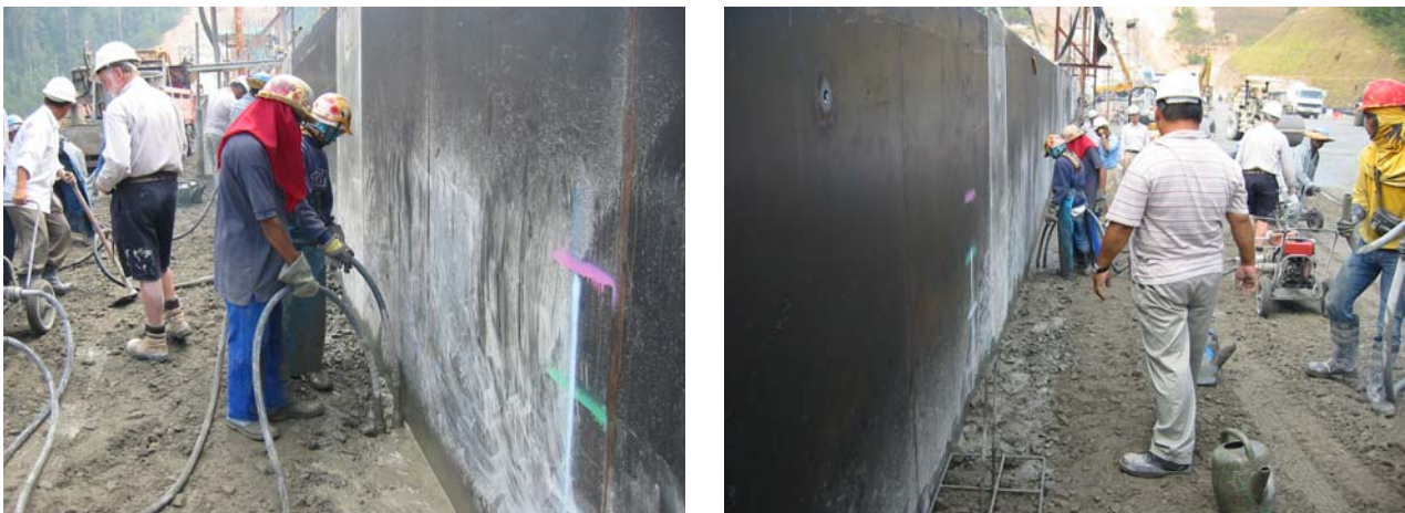
Photo 10 - Applying grout and poker vibration of GERCC at Kinta Dam

The ultimate objective is to keep grout dose rates to a minimum if strength and full compaction of the RCC/GERCC interface is to be achieved.