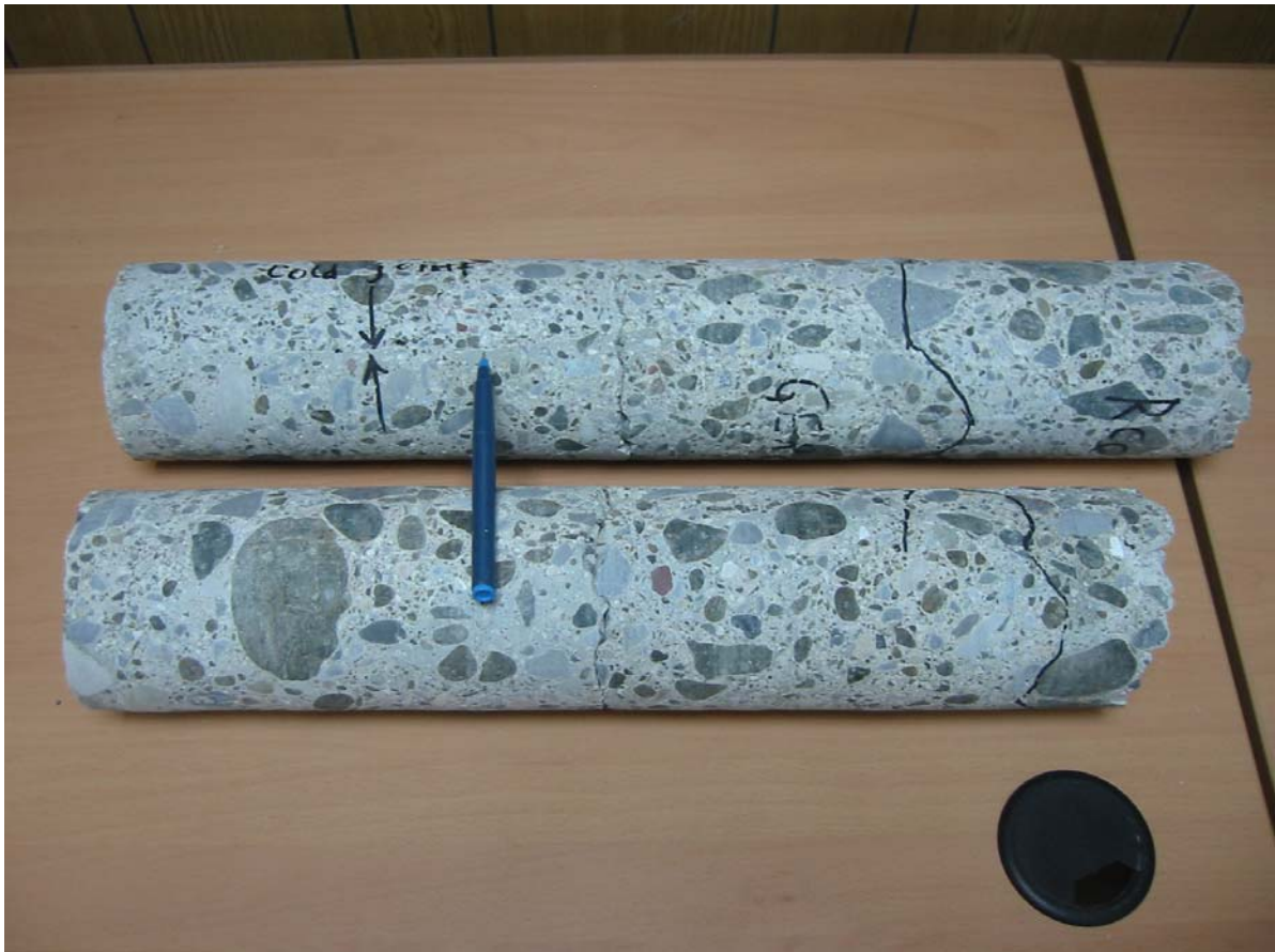
Photo 15 - Horizontal 150mm cores from Wadi Dayqah Dam through 400mm of GERCC and into RCC beyond line marked on right, fracture to the left is deliberate drilling break, top core through a bonded cold lift joint using bedding mortar.