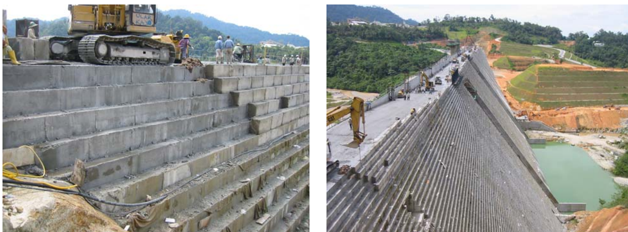
Photo 7 - Kinta Dam, pre-cast block forms for 0.6m d/s steps for SLM in 3m lifts

For inclined downstream faces the best arrangement appears to be to use vertical steps. If formwork is used then the step height would be equal to the lift height. At Jiangya Dam and also Kinta Dam (90m high 0.9mill m3, Malaysia 2006) where 3m high lifts were used, precast concrete blocks were provided to form the 1m and 0.6m high steps on the downstream face respectively. Blocks are simply recovered from behind and added ahead of the advancing layers as the horizontal RCC steps were constructed and a base for the blocks to form the next step above became available. This stepped precast block 'formwork' system would appear to be an ideal method where more than one step is required to match the selected lift height.