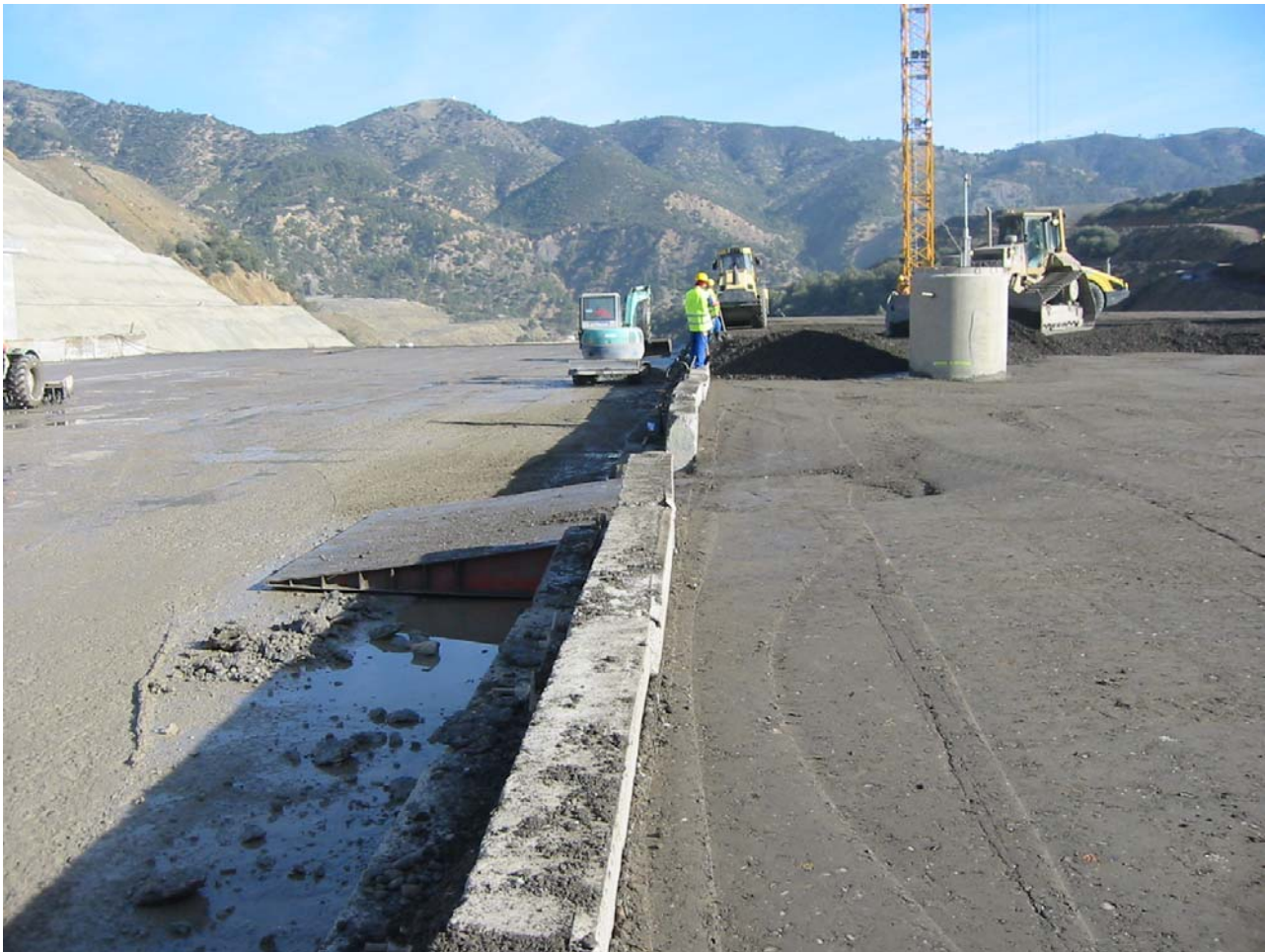
Photo 2 - Koudiat Acerdoune Dam, 121m high, 1.65mill m3 Algeria 2007, placing 4 RCC layers with end form and access ramp for a 1.2m lift

The main advantage of this method is that it simplifies the forming up of the downstream stepped face of the dam, which is complex when lift heights exceed the step height.