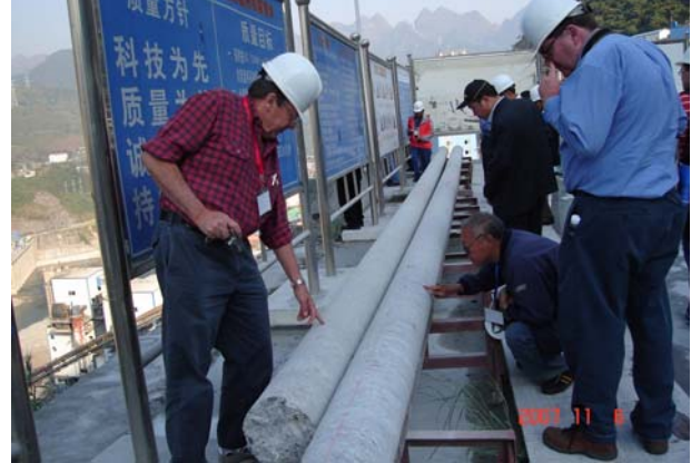
Photo 8 - Left, lengths of core up to 5m long from Jiangya Dam, right, 15.1m from Longtan Dam where horizontal lifts were placed within a retarded initial set time