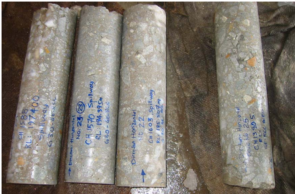
Photo 14 - Horizontal 150mm dia cores from Kinta Dam spillway through 400mm of GERCC and into RCC, core on left is through a lift joint

Cores taken horizontally through the facing and into the parent RCC behind, consistently show fully compacted GERCC, often with no clear indication of the transition to the RCC which appears monolithic with the GERCC. Likewise horizontal cores taken across lift joints have consistently shown excellent bond between GERCC lifts.