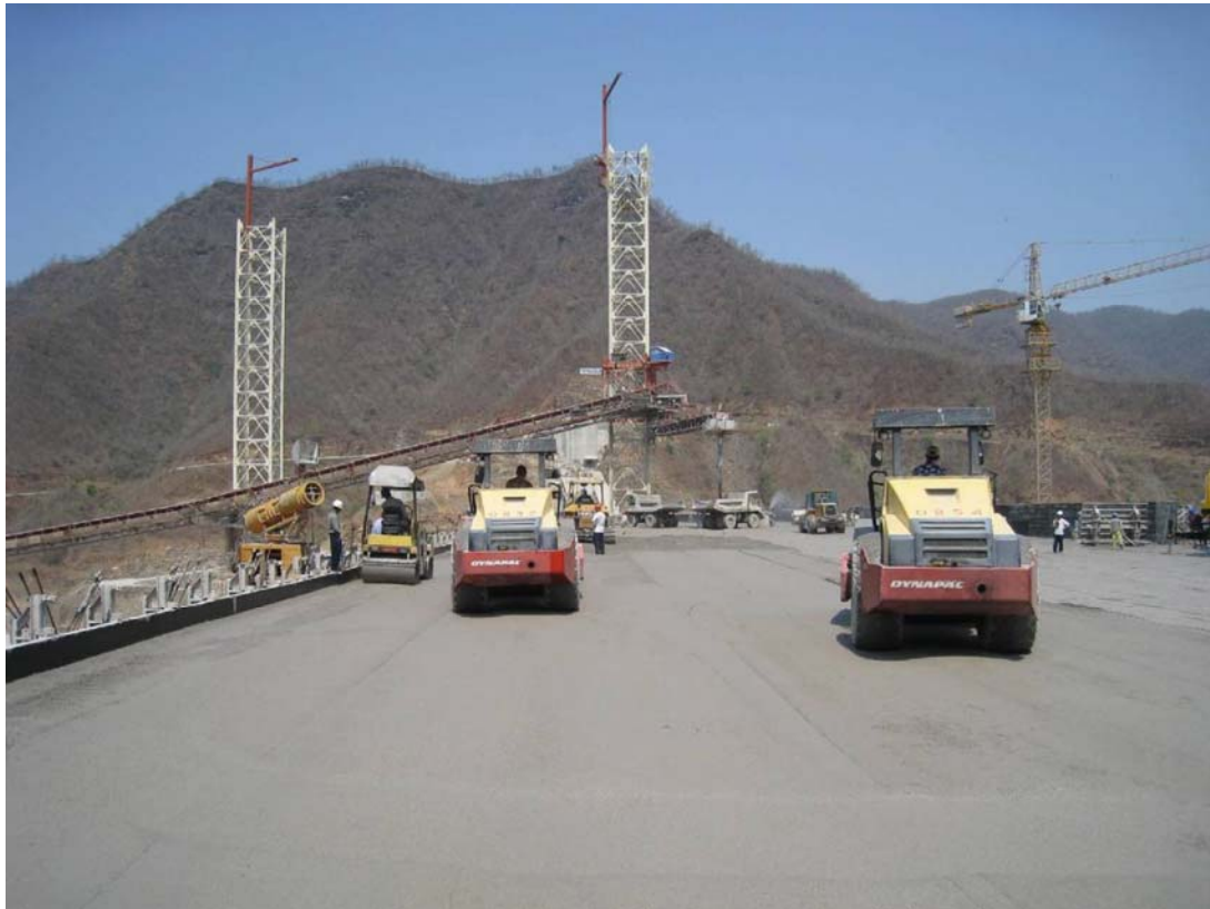
Photo 4 - Yeywa Dam 134m high, 2.4mill m3 Myanmar 2008, placing 1 lift/day over full dam area using high RCC placing rate

Simply changing the slope selected for the layers alters the volume of RCC placed in the 300mm thick sloping layer. For example, using say 3m high forms, as were adopted at Jianguya, with an RCC mixer output of 500m 3 /hr and initial set time of the un-retarded RCC of 2 hours, and a width between upstream and downstream faces of 'W', then 'S', denoting the slope shown in the Figure 1 below, will need to be: