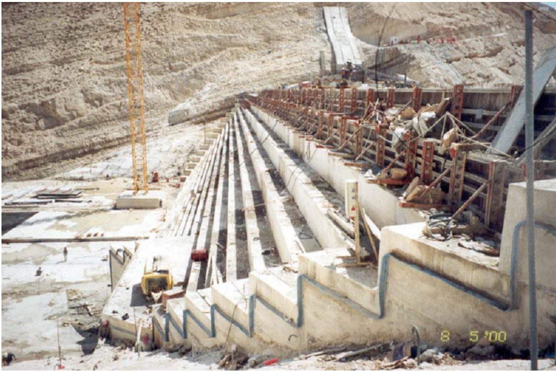
Photo 13 - Horizontal waterstops at Tannur dam embedded in GERCC facing

Cores taken horizontally through the facing and into the parent RCC behind, consistently show fully compacted GERCC, often with no clear indication of the transition to the RCC which appears monolithic with the GERCC. Likewise horizontal cores taken across lift joints have consistently shown excellent bond between GERCC lifts.