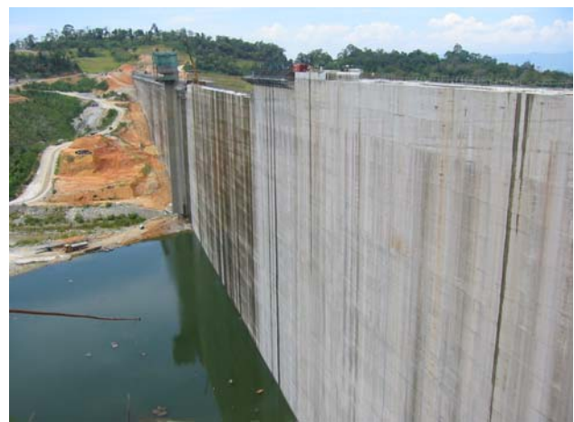
Photo 9 – GERCC upstream facing, left Kinta Dam 90m high, right Ralco Dam 155m high

For the GERCC process to 'work', the applied grout needs to fully drain down into the spread RCC lift, to do this it is essential that the RCC is in a loose, 'as spread' condition. Usually it is necessary to trim back by hand the low windrow left by the dozer blade that develops along the forms and to roughly level off the surface of the RCC to that expected of the 'final' GERCC surface before applying the grout. Also it can assist grout penetration and distribution if the RCC is hand 'rodded' using a length of 12 mm diameter reinforcing rod, say at regular 200-250mm intervals, to full depth of the lift.